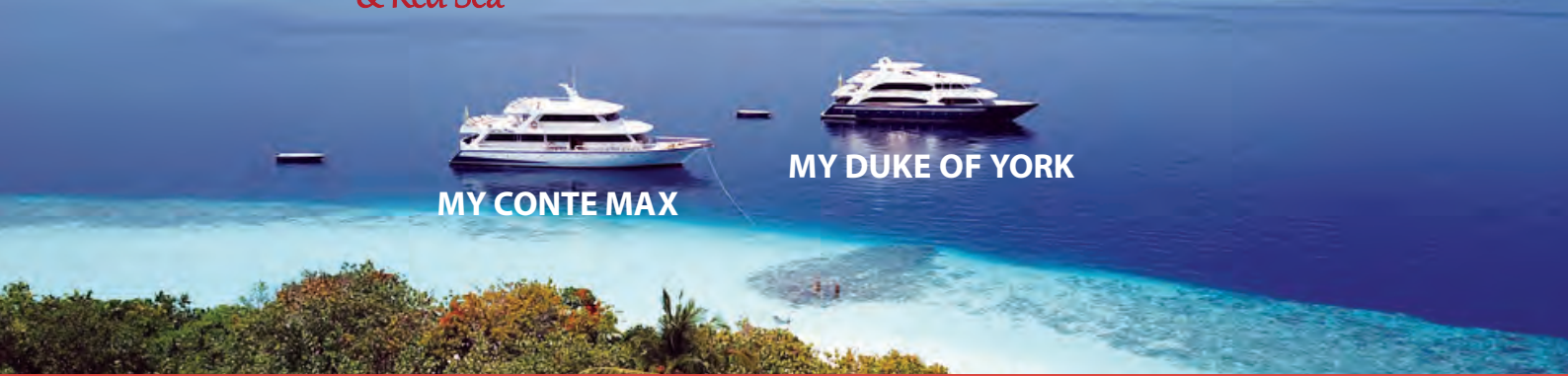
MY CONTE MAX